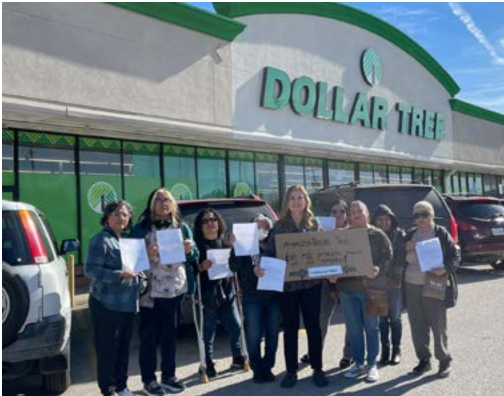
Texas Environmental Justice Advocacy Services (TEJAS) Participating in CHS' 2024 National Week of Action

Communities of color and low-income residents living near PVC manufacturing plants are regularly exposed to toxic chemicals from air emissions, and also face elevated risks from chemical disasters, including leaks, fires and explosions. 56 Numerous other highly hazardous chemicals are used or released during the production, use, and disposal of PVC plastic, including chlorine gas, asbestos, mercury, ethylene dichloride, phthalates, bisphenol A (BPA), organotins, heavy metals, chlorinated paraffins, dioxins and furans, and numerous other additives and chlorinated byproducts. 57 The community in Pasadena, TX is one example.