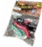
Critter Creatures plastic figures purchased at Dollar General