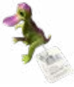
Dino Buddy toy purchased at Dollar General