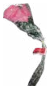
Bouquet of plastic flowers, purchased at Dollar Tree

Lead was found in a range of holiday decorations purchased at dollar stores, including plastic roses, Easter decorations and Valentine's Day candy pails.