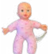
Baby doll purchased at Dollar Tree

Made with PVC Contains antimony (210 ppm)