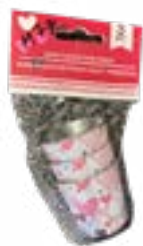
Valentines Day candy pails purchased at Dollar Tree

Contain lead (96 parts per million of lead in its accessible components)