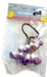
Easter-themed mini foam mushrooms purchased at Dollar Tree