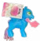
Pony toy purchased at Dollar Tree

In 2021, Dollar Tree committed to “eliminate the use of PVC in all private-brand children’s products” by 2024. 55 But private-brand products are not clearly marked - so shoppers have no way of knowing whether the toys they pick up at the store are PVC-free or not . And while Dollar Tree “encourages” its “national brand suppliers” to find safer alternatives to PVC, our testing suggests that PVC toys can readily be found on Dollar Tree shelves.