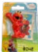
Elmo figurine purchased at Dollar Tree